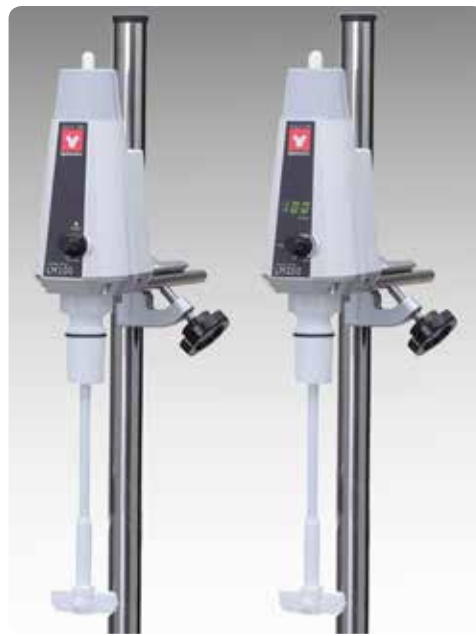
LM100 LM200 with Digital Display