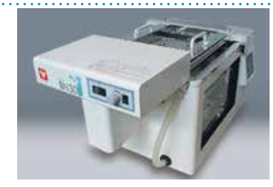
BK400 + BN300