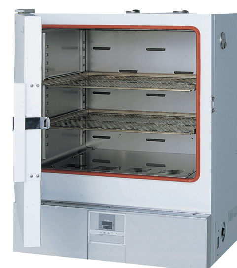
Interior of DKM600C