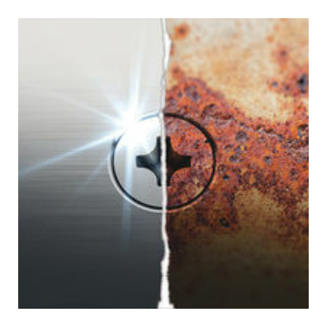
Wera stainless steel bits are manufactured out of stainless steel so unsightly rust can be avoided. The stainless steel bits from Wera are vacuum ice-hardened and have the hardness and strength needed for screw connections. There are no limitations to the industrial applications they are suitable for.

Screw stainless steel together with stainless steel!