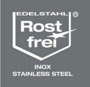
Solution to the rust problem: screw stainless steel together with stainless steel! Wera stainless steel tools are manufactured out of stainless steel so unsightly rust can be avoided.

Screw stainless steel together with stainless steel!