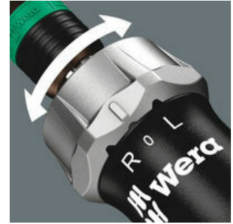
Changing ratchet direction

Ergonomic design of the reverse direction switch.