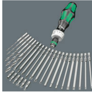
Handle/interchangeable blade system

The handle/interchangeable blade system allows rapid exchange of the blades required for a wide range of applications.