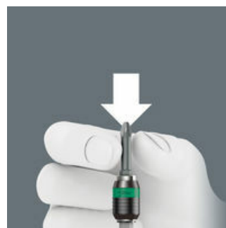
Rapid-in and self-lock

The bit can be pushed into the adaptor without moving the sleeve. The lock is activated automatically as soon as the bit is applied to the screw. Bits are held securely and wobble-free.