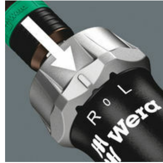
Fine adjustment work

Additionally, the lockable neutral position permits exact adjustment work without having to change the screwdriving direction every time. Lockable neutral position for fine adjustment work.