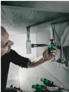
Hollow shaft for protruding threaded rods