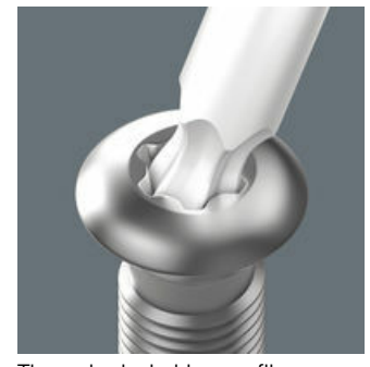
The spherical drive profile means that it is possible to swivel the axis of the tool to that of the screw, and therefore enable angled, "around-the-corner" screwdriving inbs