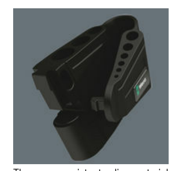
The wear-resistant clip material ensures that the L-keys are securely held yet are easy to remove.