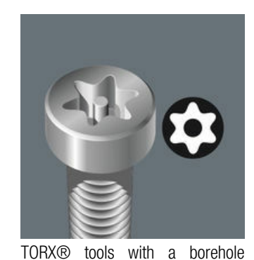
prevent the unauthorised unfastening of safety screws. The screws contain a pin that protrudes into the drive profile so that "normal" TORX® tools cannot

that "normal" TORX® tools cannot be used. This pin fits into the borehole of TORX® BO tools allowing safety screws to be