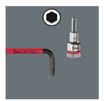
Take it easy tool finder system with profile and size colour-coding for quick and easy tool selection. Colour-coded system for hexagon drive screws (L-Keys, Zyklop bit sockets), external hex drive screws and nuts (Joker wrenches, Zyklop sockets and Zyklop bit sockets with holding function), and TORX® drive screws (L-Keys, Zyklop bit sockets).