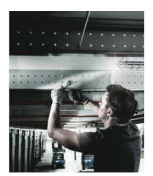
With the Joker, you can now loosen and tighten nuts and bolts, in situations where conventional tools fail. Particularly in confined spaces, where conventional openjawed wrenches cannot be used. The combination of limit stop and small return angle enables eff ective work, even on screw pipe connections.