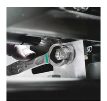
When we began to think about open-ended wrenches, we asked ourselves: why does the wrench always have to be flipped over; why does it have an offset design; why does it slip off injuring fingers? The new design of the mouth resulted in a real "Joker" that works even when all other trumps have been played.