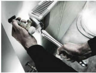
Joker 6004: Automatically and continuously self-setting