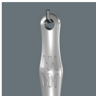
Joker 6004: Useful hole for hanging

Thanks to its hole the Joker can be neatly hung on the workshop wall.