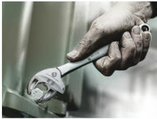
Joker 6004: Automatically and continuously self-setting