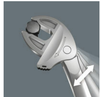
Joker 6004: Ratchet mechanism for fast work

The ratchet function in the mouth sees to fast and consistent screwdriving without removing the tool.