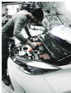
Zyklop ratchet and accessories for Electricians