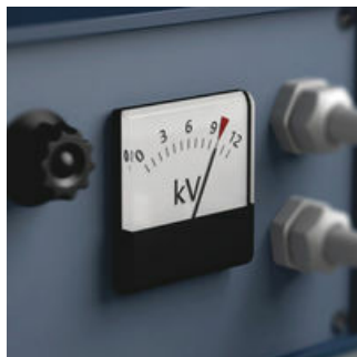
The individual testing of the Zyklop tools for electricians at 10,000 volts, in accordance with IEC 60900, guarantees safe working under voltages up to 1,000 volts.