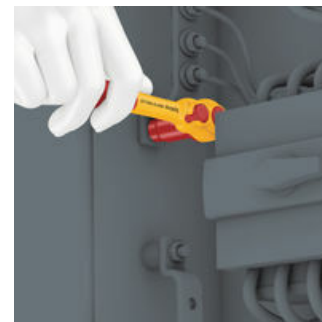
The extremely slim design of the Zyklop VDE ratchet makes it easy to work, even in confined spaces.