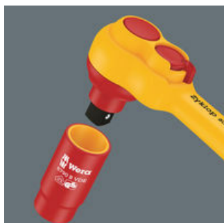
The ball lock ensures sockets and accessories are securely fitted, providing increased safety during operation. A short press on the release button allows the tool to be changed quickly.