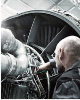
Lasertip prevents slipping out

Kraftform Plus screwdrivers - ergonomics you can grasp. They relieve the entire hand-arm system even when used intensively. Along with other technical and product advantages such as the Lasertip for a secure fit in the screw head, Kraftform screwdrivers are the ideal choice whenever manual screwdriving jobs are concerned.