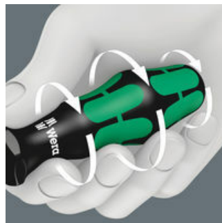
Rapid hand repositioning

The hard materials used for the handle ensure rapid hand repositioning without any danger of the skin "sticking" to the handle. The surrounding hard zones with large diameters glide like wheels through the hand.