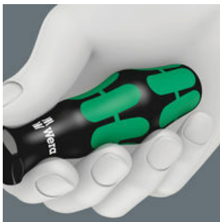
Prevents hand injuries

The outstanding design of the Kraftform handle that fits perfectly into the hand prevents hand injuries such as blisters and calluses.