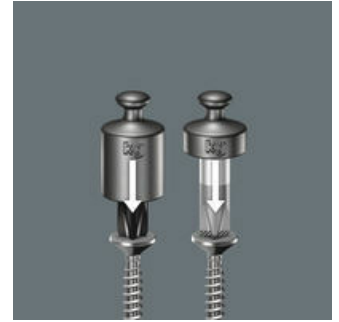
Reduced contact pressure

Wera Lasertip reduces the contact pressure required and enhances force transfer - meaning less screwdriving effort is required. Screwdriving becomes safer and easier.