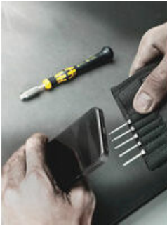
In a practical pouch