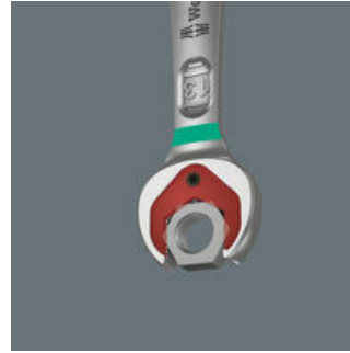
Ring ratchet spanner Joker 6000

The Joker's holding function means that nuts and bolts can be held in the jaw and easily positioned where they are needed. Fastening on to the thread can then be done quickly and safely, thanks to the innovative special stop-plate which holds the fastener. No more time-wasting searches for dropped nuts and bolts! After applying and positioning the nut or bolt, fastening can begin immediately - no additional tools required.