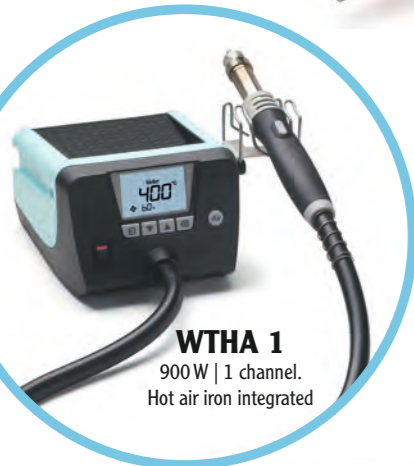
WTHA 1 900 W | 1 channel. Hot air iron integrated