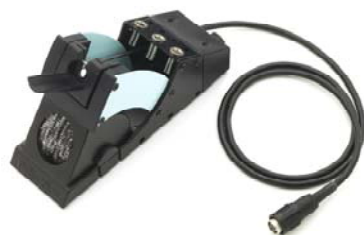
WDH10T Stop + Go Stand with Dry Tip Cleaning System