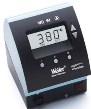
WD1M Power Unit (date code 04/08 or later)