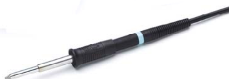
WP120 120 Watt Soldering Pencil

ESD Safe – RoHS Compliant – MIL-SPEC compliant