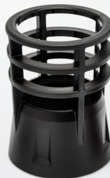
Part of Accessory Kit 2 WLACNSETHG2