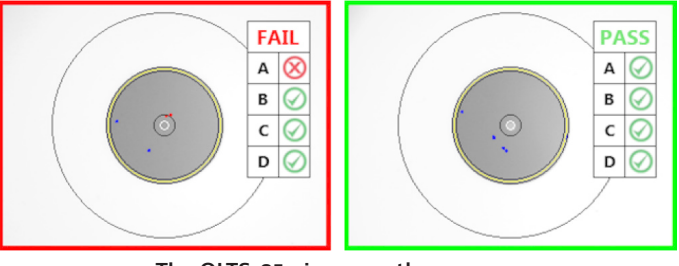
The OLTS-85 gives you the answer:

Which of these connectors meets the IEC spec?