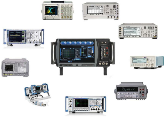
Figure 1. The 7200B takes the place of an entire suite of test equipment