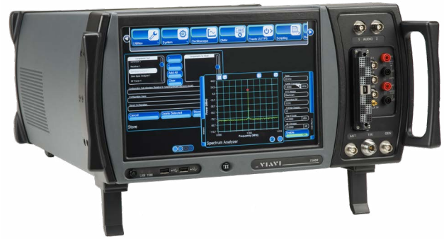
Figure 2. State-of-the-Art Touch-Screen User Interface

With a 12.1 inch high resolution touch-screen based user interface, the 7200B provides the most advanced and user friendly operator interface in the industry. It’s highly intuitive design is a result of extensive research and development focused on user experience, graphical design and content depiction, and modern user interface techniques applied to the unique needs of test instrumentation and its operating environments.