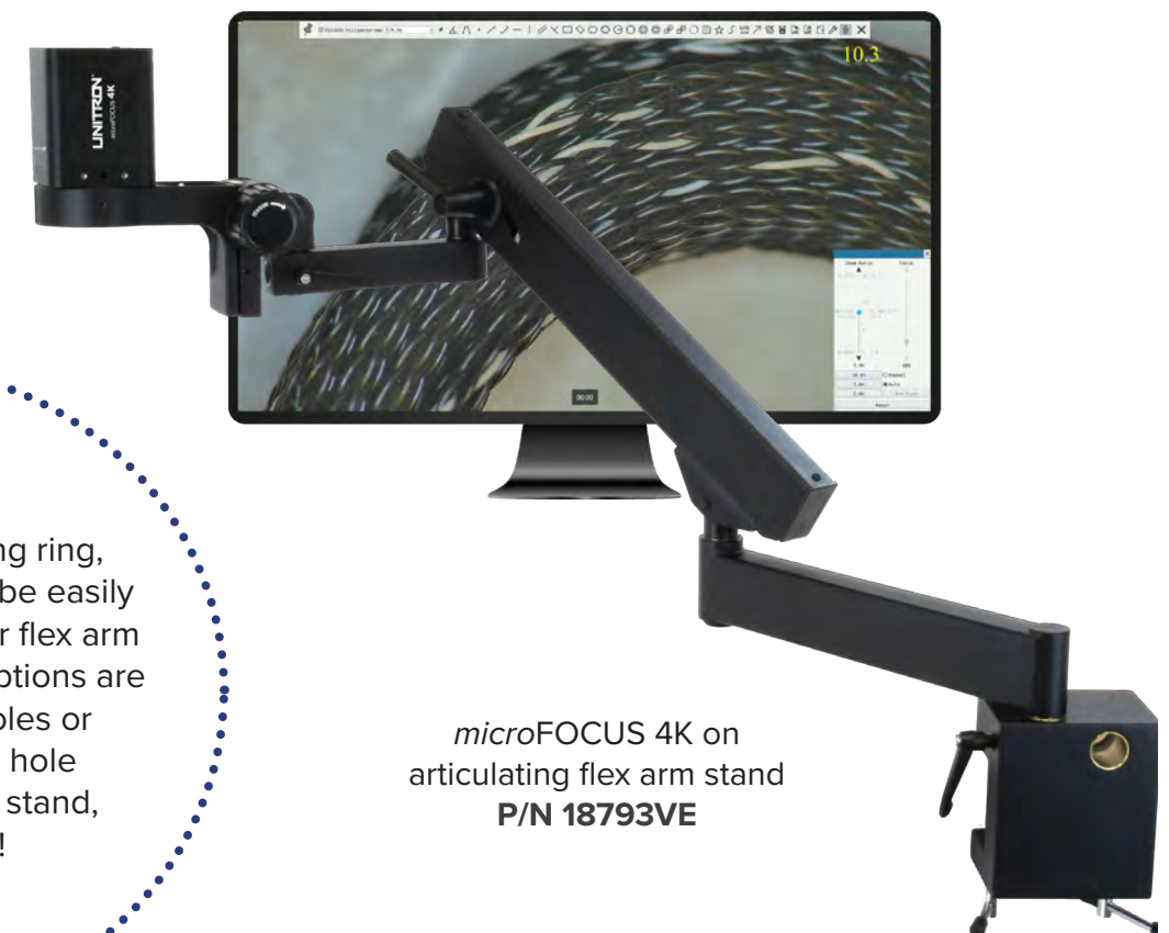
micro FOCUS 4K on articulating flex arm stand P/N 18793VE

With a Ø76mm mounting ring, the micro FOCUS 4K can be easily mounted to boom, pole or flex arm stands. Other mounting options are available via 2 x M4 holes or single 1/4-20 threaded hole for mounting to a copy stand, tripod, and more!