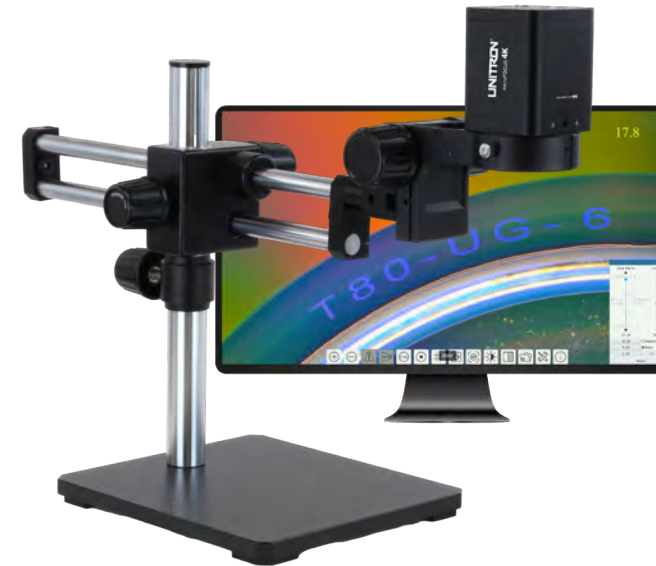
micro FOCUS 4K on ball bearing boom stand P/N 18791BB