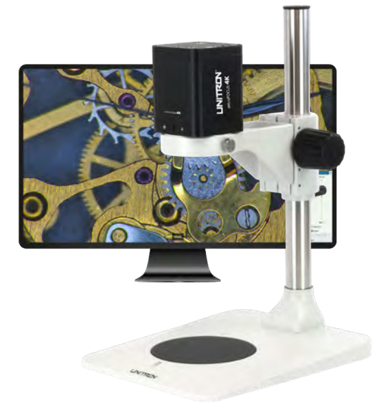
micro FOCUS 4K on pole stand P/N 18790PS