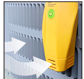
Outdoor Temperature Probe

Magnetic hanger allows for temperature measurements in direct air stream.