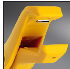
Wireless Pipe Clamp

Narrow head for tight spaces with a thermally isolated sensor for greater accuracy.