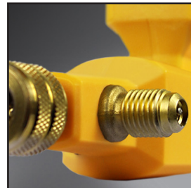
Wireless Pressure Probe

Pass thru port hook up, no hoses or adapters needed. 180° articulation allows access in tight spaces.