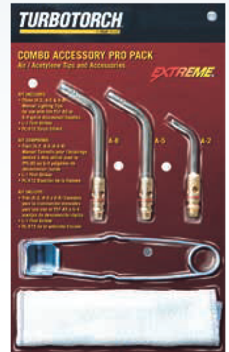
Combo Accessory Pro Pack Part No. 0386-0577