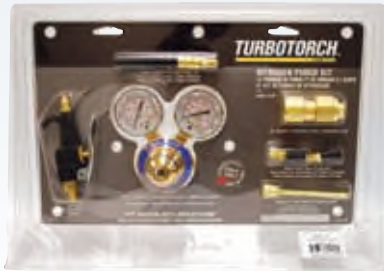
NPK-TT Nitrogen Purge Kit Part No. 0386-1370