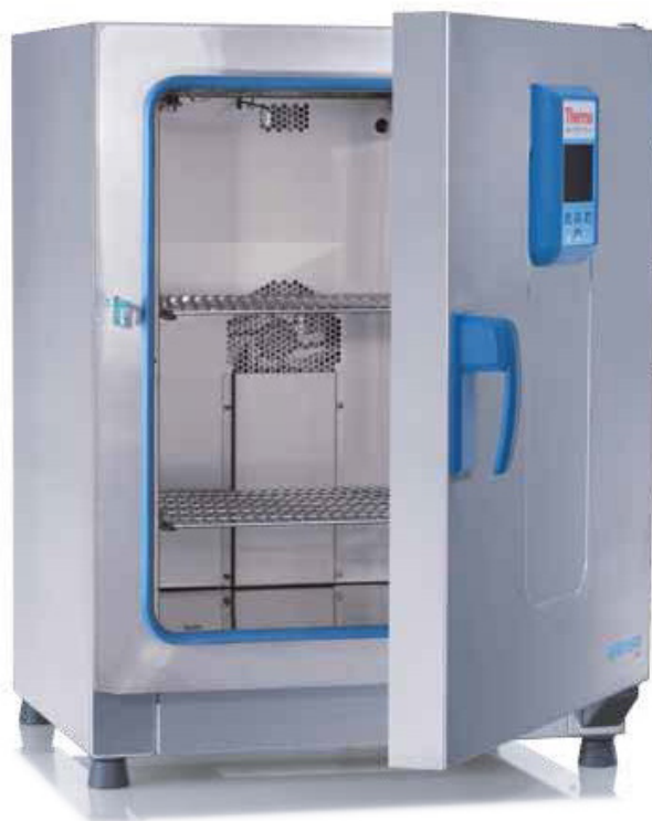
100 L model shown