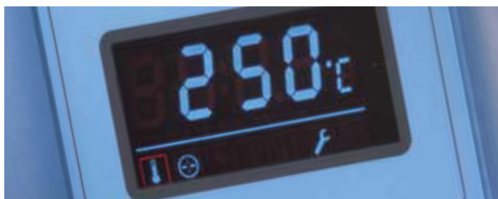
Easy-to-view, vacuum fluorescent display with simple-to-use touch button operation