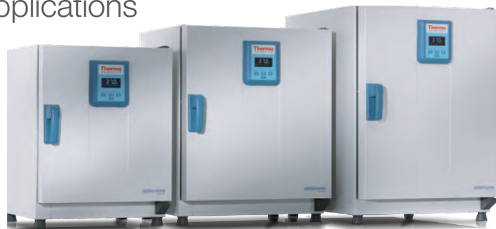
Heratherm General Protocol Ovens, 60 L, 100 L, 180 L models