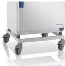
Support stand with casters