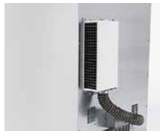
Fresh air particle filter