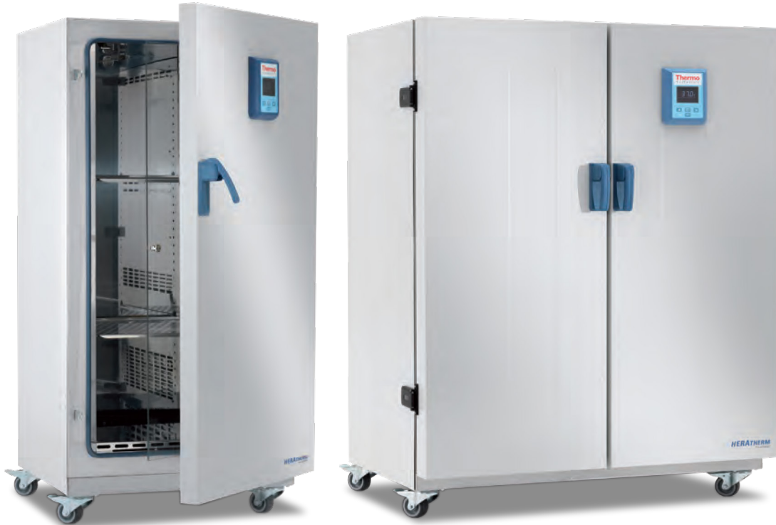
Heratherm large capacity ovens are available as 400 L and 750 L units

Heratherm large capacity ovens have been designed with your need for larger samples or high sample volume in mind. The General Protocol ovens provide high capacity for day-to-day drying and heating applications.