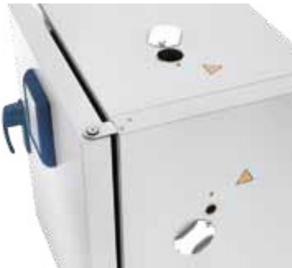
Additional access ports top and right