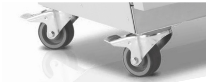
Factory installed casters allow for increased mobility and make setting up your lab easy

Heratherm large capacity ovens offer up to 23% energy savings compared to conventional ovens*