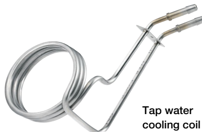
Tap water cooling coil

Various adapter boxes and communication cables are available to allow for serial and analog communication.