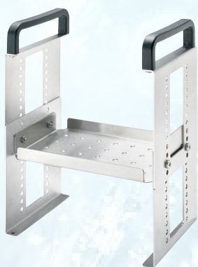
Stainless steel rack