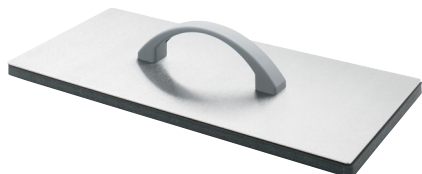
Stainless steel work area cover

Directly control temperature of an external batch or application by placing the temperature sensor into the external application.