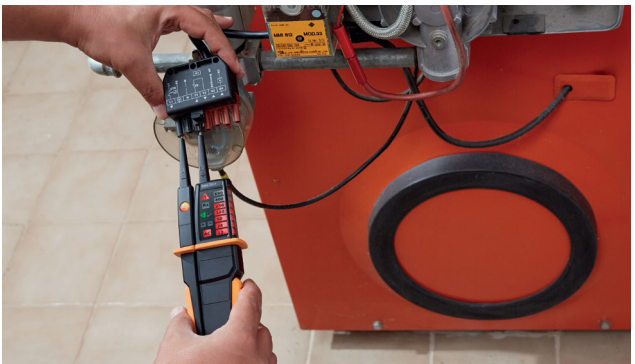
Check relay activation on a heating system with testo 750 .