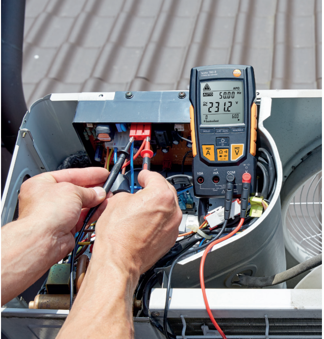
Measuring voltage on an air conditioning condenser with testo 760 .