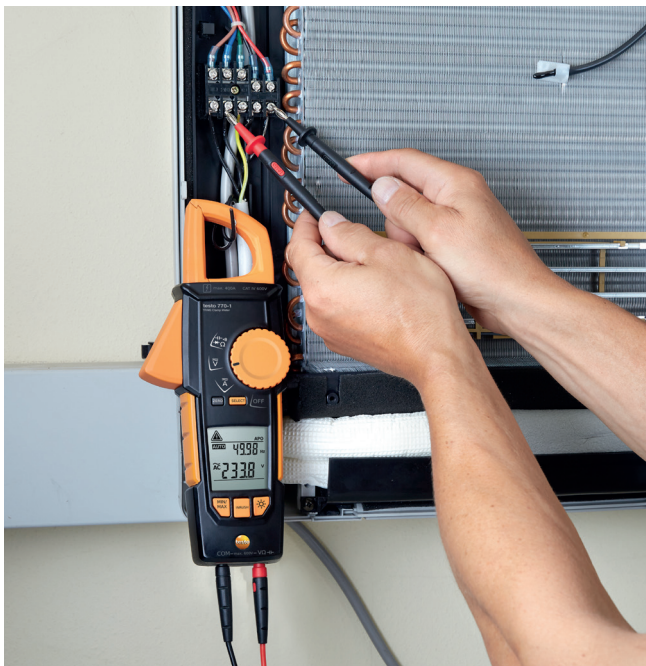
Measuring voltage, current, and real-time power on an air conditioning unit with testo 770-3 .