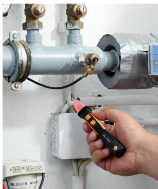
Checking for live voltage in a junction box with testo 745 .