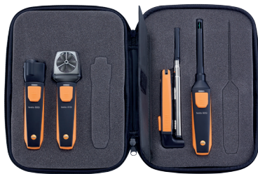
VAC Smart Probe Kit: 0563 0003