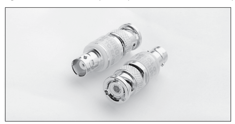
Figure 1: 7078-TRX-BNC (CS-633) 3-Slot Triaxial to BNC adapter

The Model 7078-TRX-BNC (CS-633) is a three-slot triaxial to socket BNC adapter. It can be used to connect BNC cables to equipment with three-lug triaxial socket connectors.