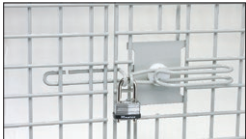
Handle (Closed Position)