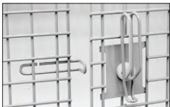
Handle (Open Position)