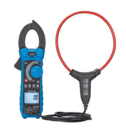
TNP477 Heavy-Duty True RMS Clamp Meter with Bluetooth and Flex Probe