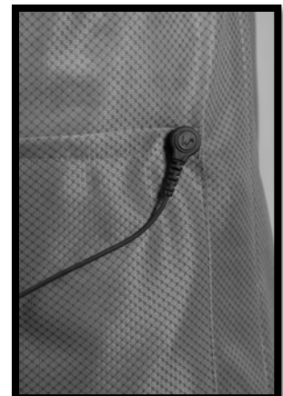
Standard Ground Cord connected to snap on pocket

(See back for dimensions & additional information)