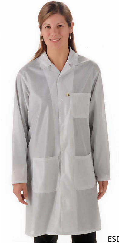
ESD Knit Cuffs (not pictured)

This ESD coat is designed to ground the garment and the wearer through a ground cord connected at the hip pocket snap. This allows for hands-free movement without tethering one hand, which is required when using a wrist strap connected to a ground cord.