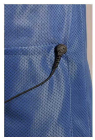
Standard Ground Cord connected to snap on pocket

(See back for dimensions & additional information)