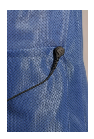
Standard Ground Cord connected to snap on pocket

(See back for dimensions & additional information)