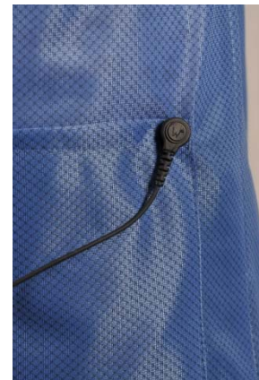
Standard Ground Cord connected to snap on pocket

(See back for dimensions & additional information)