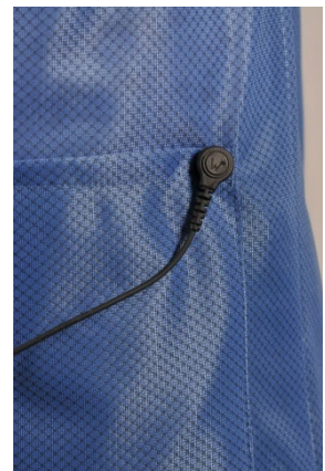
Standard Ground Cord connected to snap on pocket

(See back for dimensions & additional information)