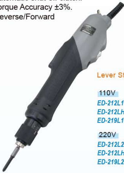
Lever Start Type

110V ED-212L1 ED-212LH1 High Speed ED-219L1 220V ED-212L2 ED-212LH2 High Speed ED-219L2