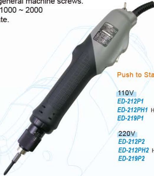
Push to Start Type

110V ED-212L1 ED-212LH1 High Speed ED-219L1 220V ED-212L2 ED-212LH2 High Speed ED-219L2