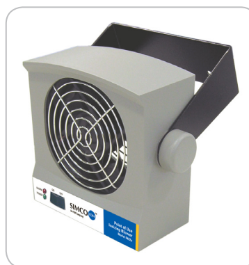
The Model 6432e is offered either with a smaller in-tool stand (shown here) or a larger benchtop stand, shown in the photo on the front of the datasheet.

For increased flexibility, the Model 6432e Blower can be directly powered by process equipment or 24 VDC/VAC power to fit the needs of your environment. For 100-120 VAC input power, use transformer #14-1420-01; for 230 VAC, use #14-1430-01; and for applications where DC input power is preferred, use #14-1322 or another 24 VDC source (performance will be reduced using DC power).