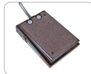
Optional hands free foot pedal.