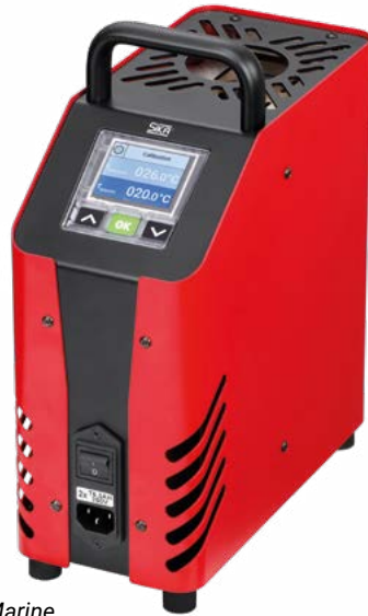
TP Basic Marine

TP Basic // Dry block // RT...650 °C // RT...1202 °F