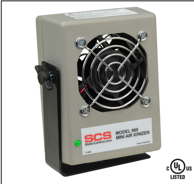
Figure 1. SCS 960 Mini Air Ionizer