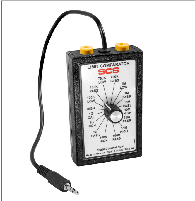
Figure 1. SCS 770769 Limit Comparator