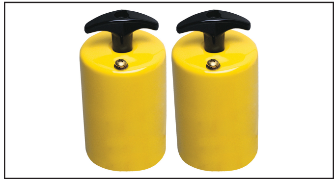
Figure 3. SCS 770767 5-Pound Electrodes

NOTE: Two 5-pound electrodes are required to complete this procedure. The electrodes provide a method for loading the resistance from the Limit Comparator onto each of the dual foot plate's plates. One pair of 5-pound electrodes are available as SCS item 770767.