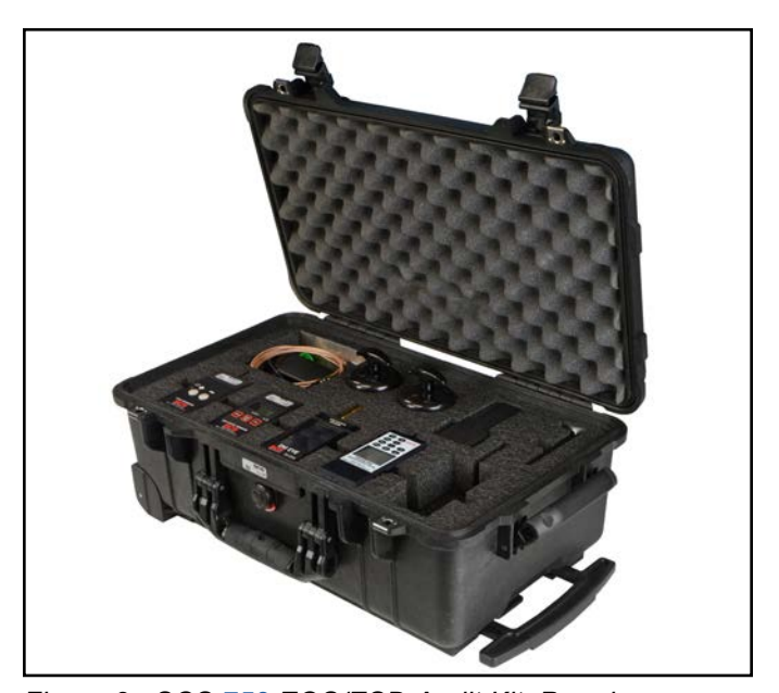
Figure 2. SCS 752 EOS/ESD Audit Kit, Premium