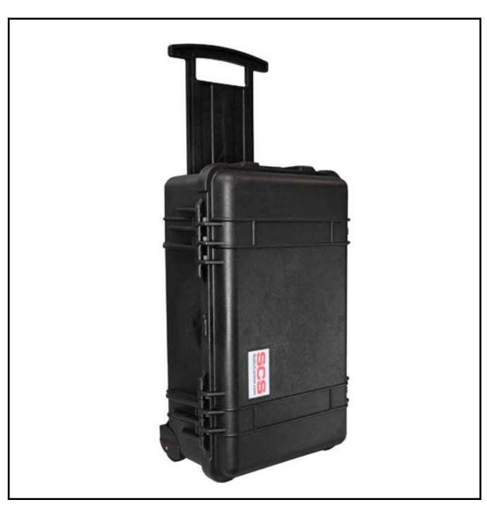
Figure 3. Extendable handle on the carrying case