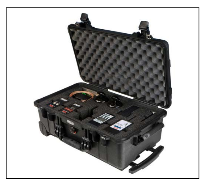
Figure 1. SCS 751 EOS/ESD Audit Kit, Standard