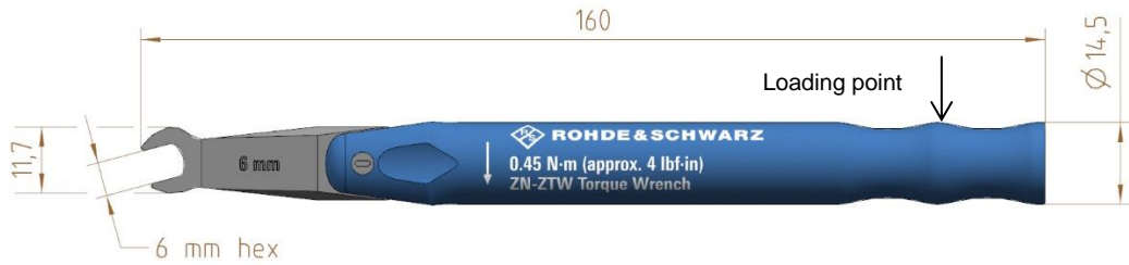
Lateral view of R&S®ZN-ZTW model .10