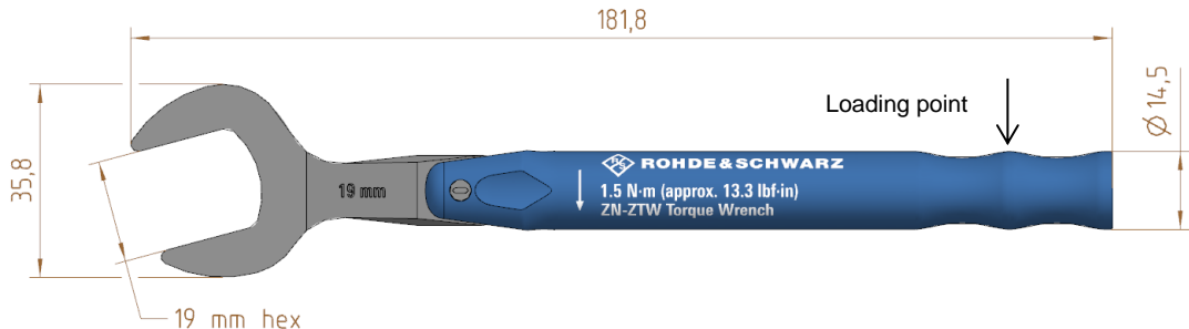
Lateral view of R&S®ZN-ZTW model .72