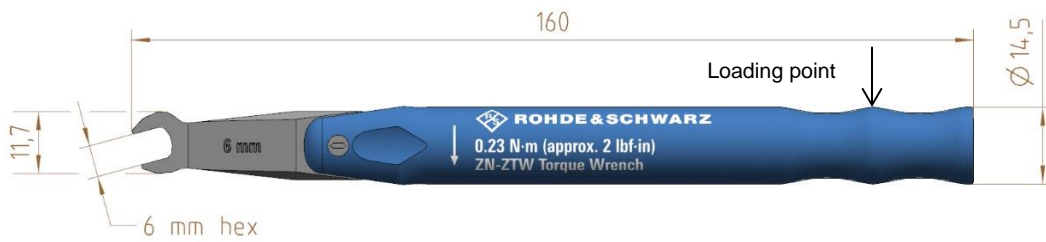
Lateral view of R&S®ZN-ZTW model .11