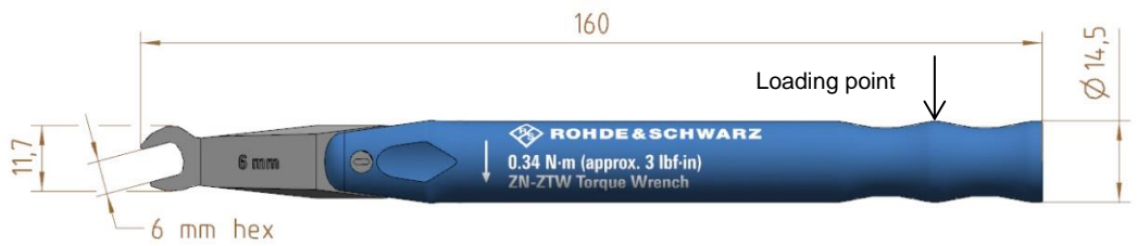
Lateral view of R&S®ZN-ZTW model .12