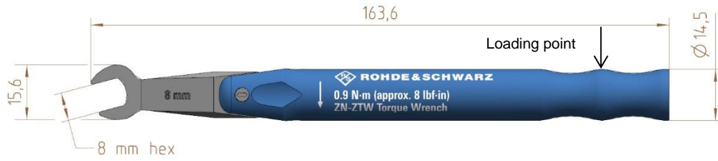
Lateral view of R&S®ZN-ZTW model .35