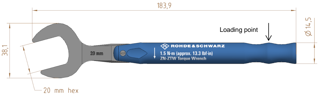
Lateral view of R&S®ZN-ZTW model .71