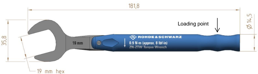
Lateral view of R&S®ZN-ZTW model .19