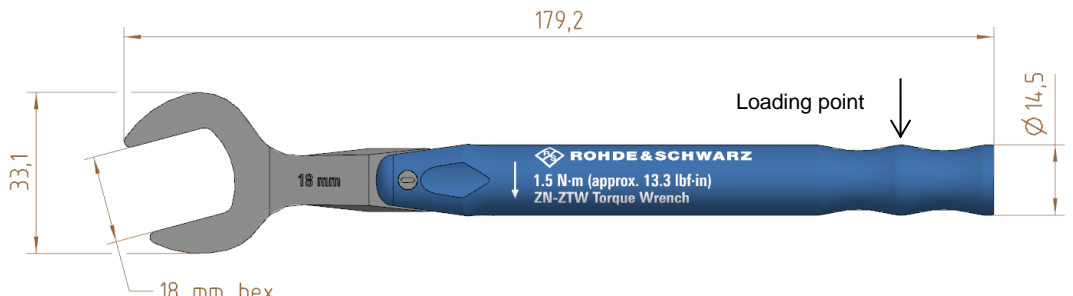
Lateral view of R&S®ZN-ZTW model .73