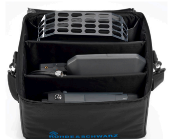
R&S®HE400Z3 transport bag (large)