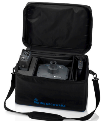
R&S®HE400Z6 transport bag suitable for R&S®HE400SHF/HE400SCB antenna module