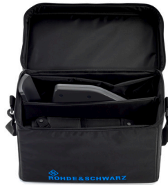
R&S®HE400Z2 transport bag (small)