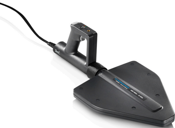
R&S®HE400MW microwave handheld directional antenna with R&S®HE400LP