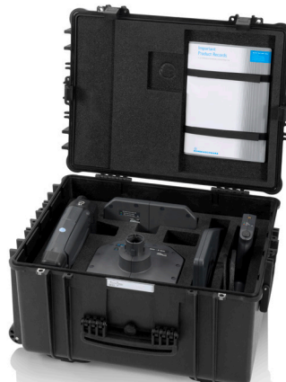
R&S®HE400Z5 transport case suitable for R&S®HE400SHF/HE400SCB