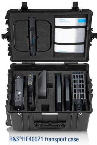
R&S®HE400Z1 transport case