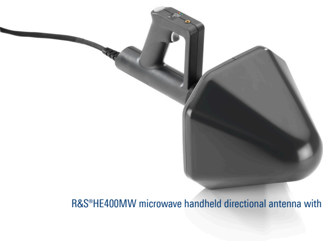
R&S®HE400MW microwave handheld directional antenna with R&S®HE400SCB