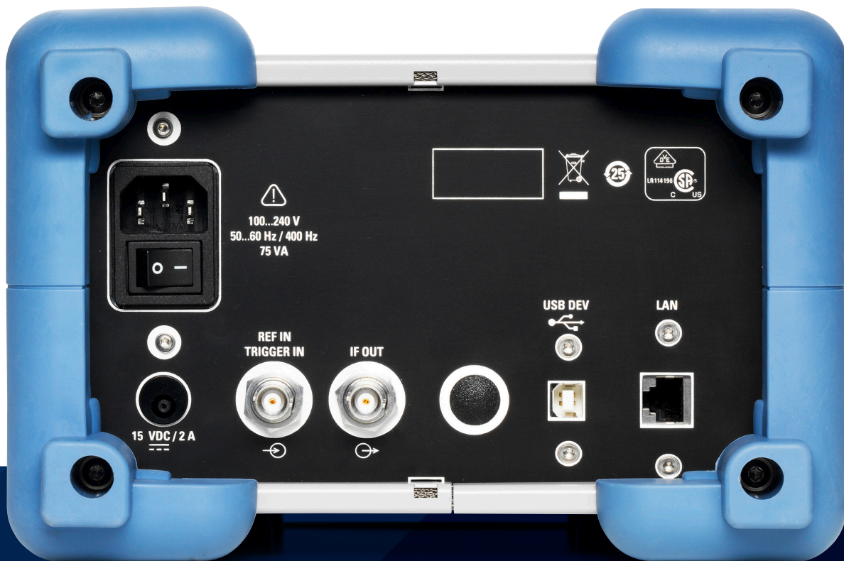
R&S®FSC rear panel

All R&S®FSC functions can be controlled via the USB and LAN interface with SCPI compatible remote control commands. LabWindows/CVI, LabView, VXIplug&play and Linux drivers are available.