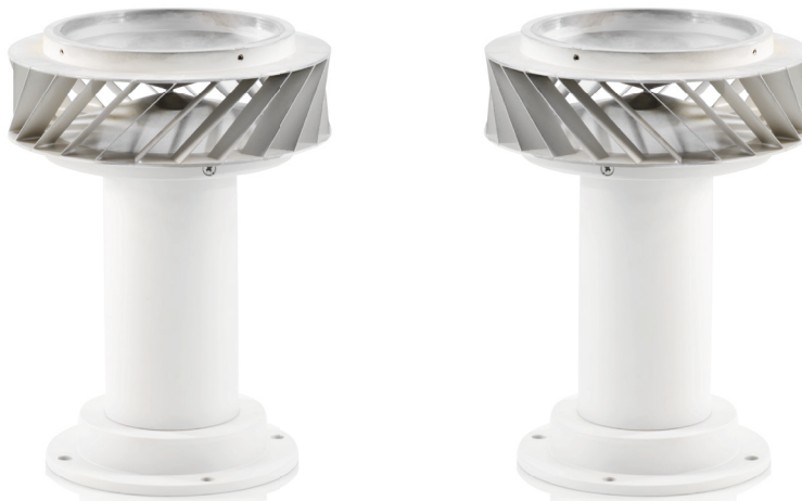
Antennas without weather protection cover.