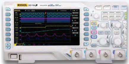
DS1000Z Series Digital Oscilloscopes

Models are available at 50MHz through 200MHz, with 1GS/Sec Sampling, up to 24MPts of memory and a Multi-Level Intensity Graded, 7" WVGA display. The DS1000Z Series of Digital Oscilloscopes is the perfect choice for educators needing an advanced analysis oscilloscope. Available options like 16 channel logic analysis, serial decode and an integrated 2 channel source make this a powerful analysis tool.