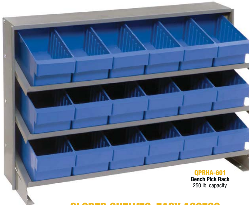
QPRHA-601 Bench Pick Rack 250 lb. capacity.

Sturdy steel racks with Super Tuff Euro Drawers create an efficient flow system. Sloped shelving provides easy access to stored items. Drawers can be removed from racks easily. These gray colored baked enamel, free standing racks assemble easily. Mobile unit has a 1,200 lb. capacity and is equipped with 2 swivel, 2 rigid casters. One drawer color per system.