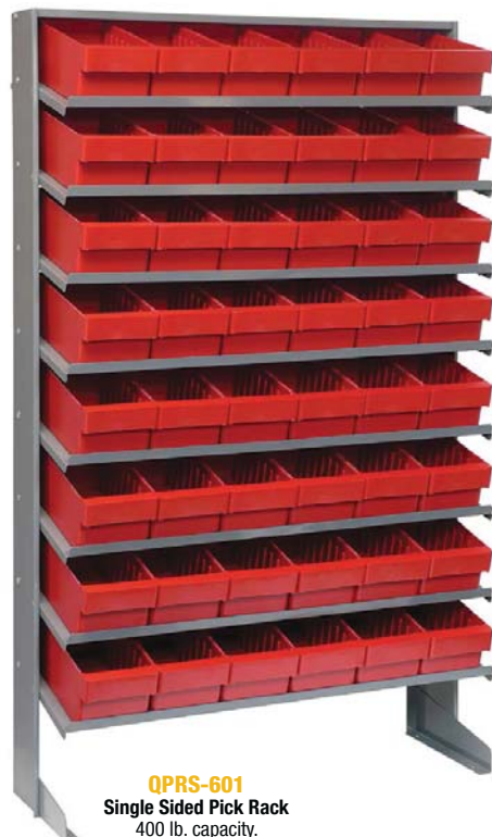
QPRS-601 Single Sided Pick Rack 400 lb. capacity.